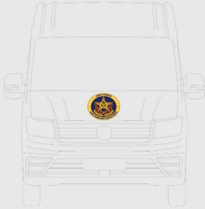
Left side - VW Crafter