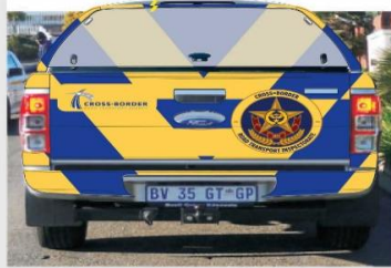
Back side - Ford Ranger